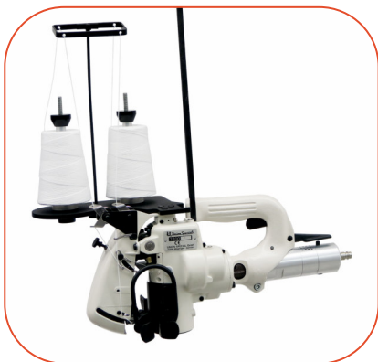
Compressed air-powered Style 2200L is ideal for humid environments. Hose and regulator are not included.