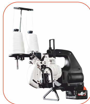
Battery powered Style 2200GMR for operations where no electricity is available! Plug in battery charger included.