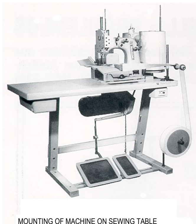
MOUNTING OF MACHINE ON SEWING TABLE WITH CLUTCH MOTOR