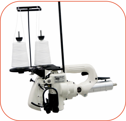
Compressed air-powered Style 2200L is ideal for humid environments. Hose and regulator are not included.