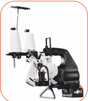
Battery powered Style 2200GMR for operations where no electricity is available! Plug in battery charger included.