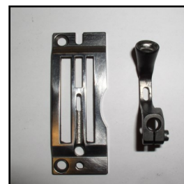
Sewing parts for 53700BZ4031:

Same as 53700BZ4031A, but with guides for filler cord from the top and / or from below for sealing the needle punctures.